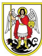
City of Šibenik