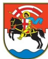
City of Zadar