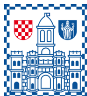
City of Split